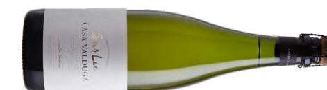
Sur Lie Unexpected, unique, natural approach