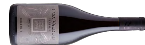
Terroir Pinot Fresh, elegant, restrained