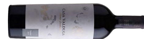
Terroir Exclusivo Tannat Powerhouse